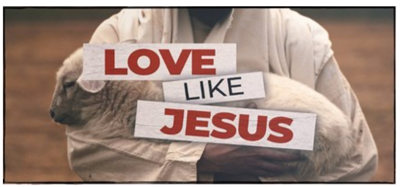
5th Sunday of Easter – May 17 & 18, 2025 United We Live God's Will