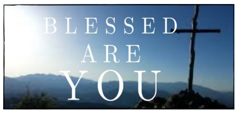
2nd Sunday after Pentecost – June 21 & 22, 2025